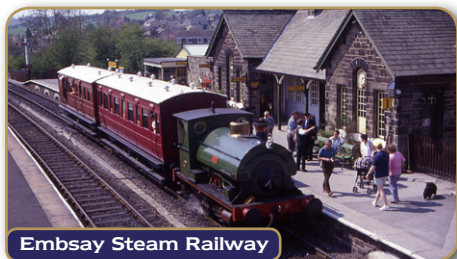
Embsay Steam Railway