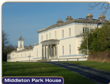
Middleton Park House

We transfer to the port for our morning return ferry crossing to Holyhead and home. (B)