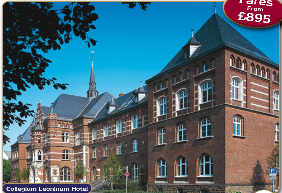
Collegium Leoninum Hotel