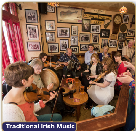
Traditional Irish Music

Today we explore the local region, beginning in Athlone , whose town centre is dominated by its Norman castle . Here we take to the majestic River Shannon on a cruise to Clonmacnoise Monastery . The Vikings used the Shannon as the main artery through Ireland and they reached Clonmacnoise as far back as the 9th century. We retrace their historical steps and visit Clonmacnoise itself, the burial place of kings and one of the most important early centres of religion and scholarship in Ireland. (B,D)