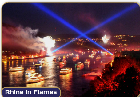
Rhine in Flames

A day at leisure to explore Bonn further. Alternatively, a short train ride northwards takes you to Cologne, with its masterpiece