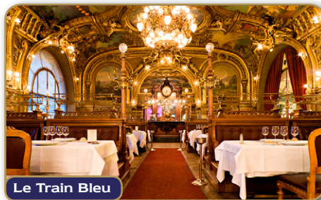
Le Train Bleu

After breakfast we transfer to Paris for the Eurostar service to London St Pancras, travelling once again in Standard Premier Class with a light meal included at your seat. (B)